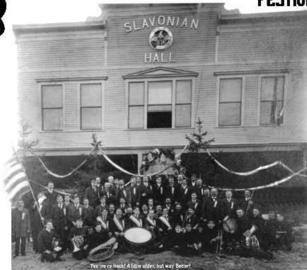
Yes we're back! A little older, but way Better!